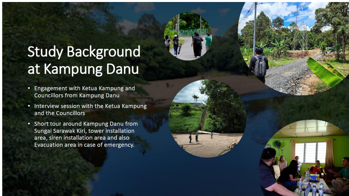
Activities conducted by another group of officers to conduct investigation at Kampung Danu on Bengoh Dam