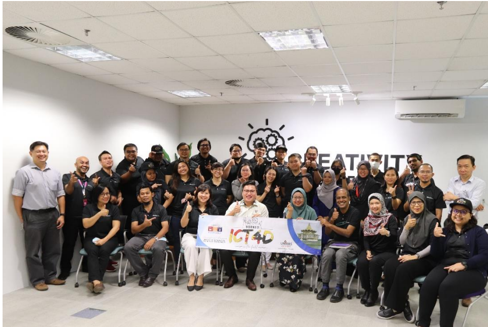
Sarawak state officials with UNIMAS FCSIT lecturers at the symposium